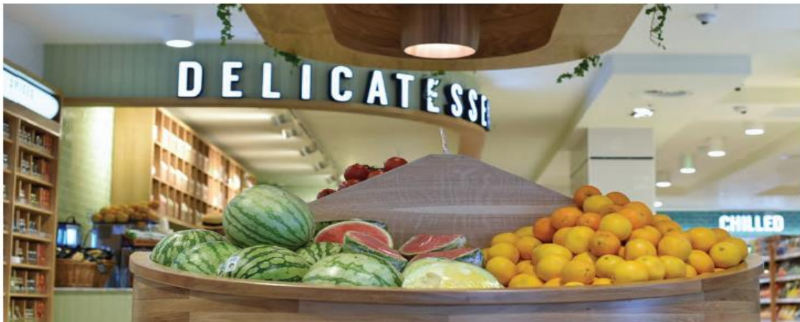
A great selection of fruit & Veg

Whether you are shopping for a bottle of milk or a bottle of Dom Perignon, The Battersea General Store will have the everyday items you need and the exceptional products you want.