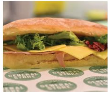
A wide variety of artisan products