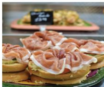
Delicious sandwiches and snacks available