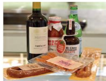
We have a wonderful hamper gift fillers